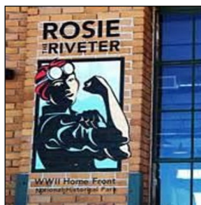
Rosie the Riveter WWII Home Front National Historic Site