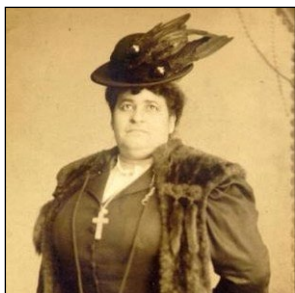
Maggie L. Walker National Historic Site