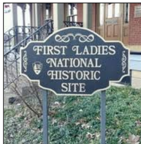
First Ladies National Historic Site