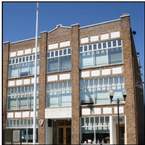
Women’s Rights National Historical Park