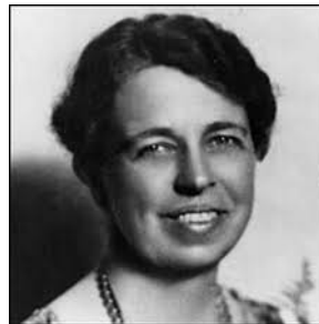
Eleanor Roosevelt National Historic Site