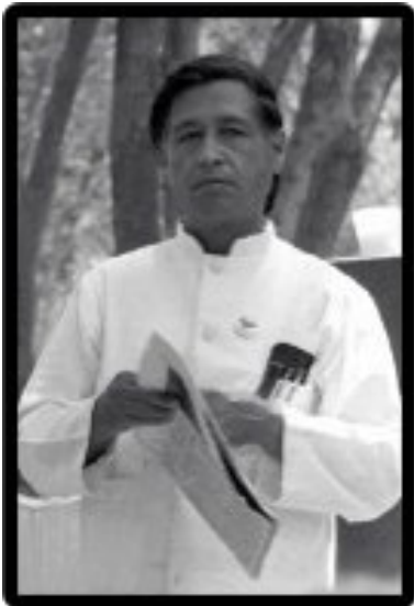
Cesar E. Chavez National Monument