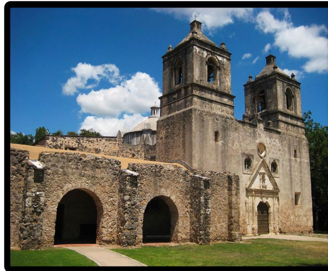
San Antonio Missions National Historical Park